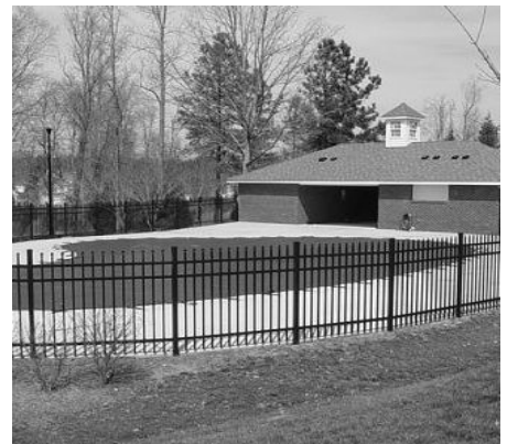
The Valleyfield Pool (winter)

The pool will open for the 2008 season on May 10th with the season closing on September 13th.